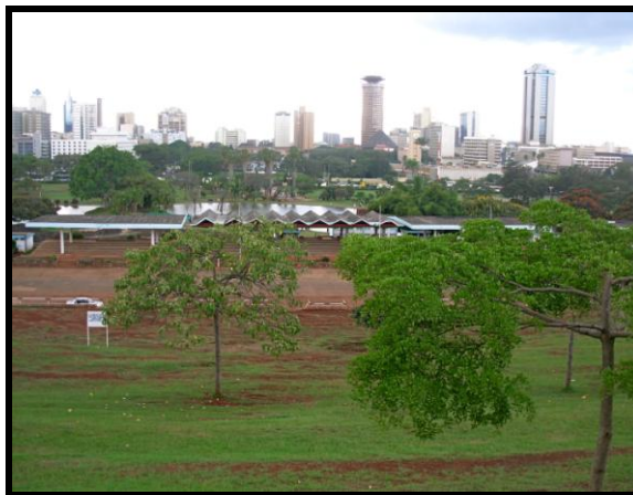
Nairobi City Centre and Uhuru Park