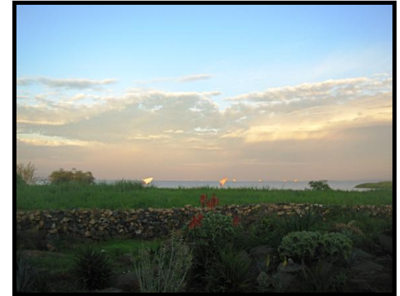
Fishing boats on Lake Victoria