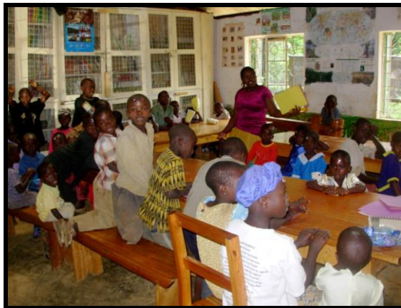
Kakamega Environmental Education Programme class

The cost of the trip will be approximately $4,000 and will be billed on your student account as a lab fee, thus enabling you to use your financial aid. In addition, you are encouraged to apply for a limited number of scholarships through the UNE Center for International Education.