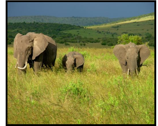
Elephant, Masai Mara National Reserve

ENV 399: Advanced Topics: Environment, Health, and Community Development in East Africa