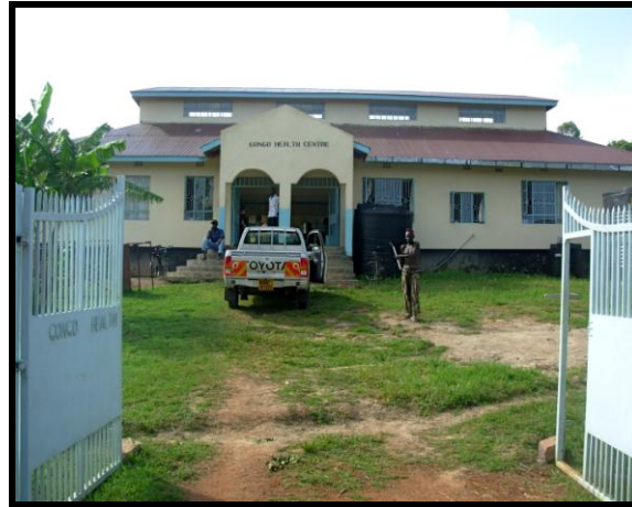
Gongo Health Center, Sauri Millennium Village